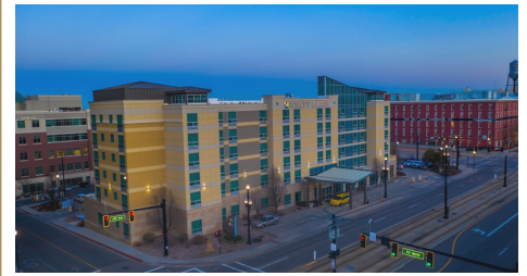
HYATT PLACE SALT LAKE CITY/DOWNTOWN/THE GATEWAY*

*Rates are based on availability and may change without notice