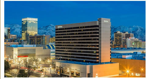
RADISSON HOTEL SALT LAKE CITY DOWNTOWN*